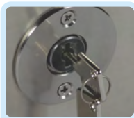
Ross 700 Key Lock (CL1)