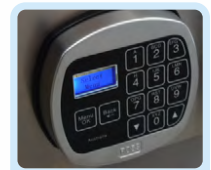
Digital Upgrade (CL2)